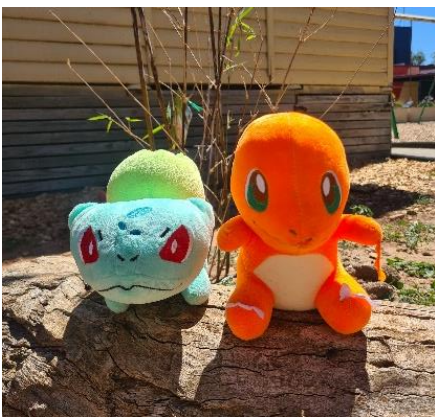
Bulbasaur and Charmander

Learning this term has included greetings, counting, number recognition, introducing ourselves and celebrating Tatsu Doshi (Year of the Dragon), Setsubun (changing of season - to Spring), Hina Matsuri (doll festival) and Hanami (cherry blossom festival).