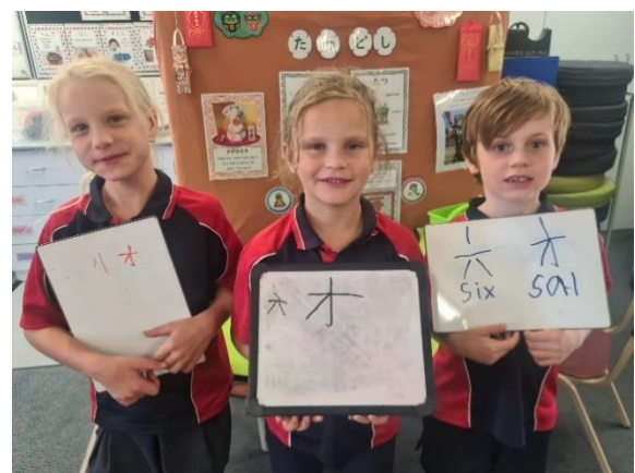
Yr 1 / 2's practising writing their age