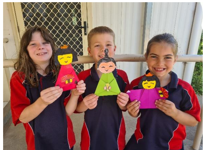
Yr 1 / 2's origami hina (dolls)