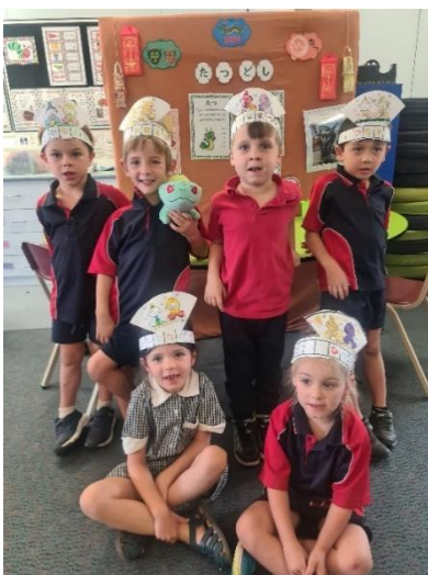
Reception's Hina Matsuri crowns