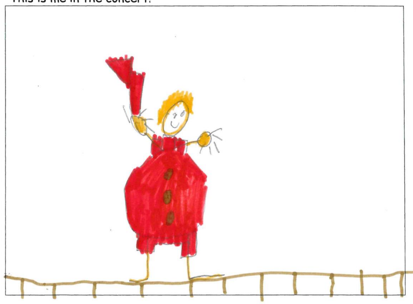
A JP student's reflection of their concert performance.