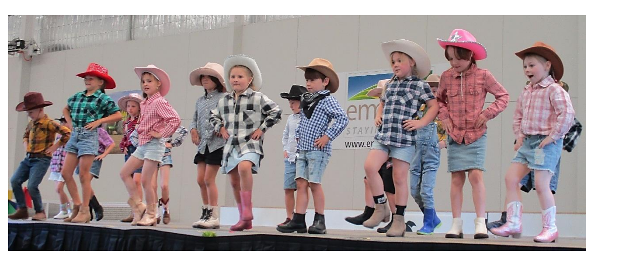
Room 8 Cotton Eyed Joe moves