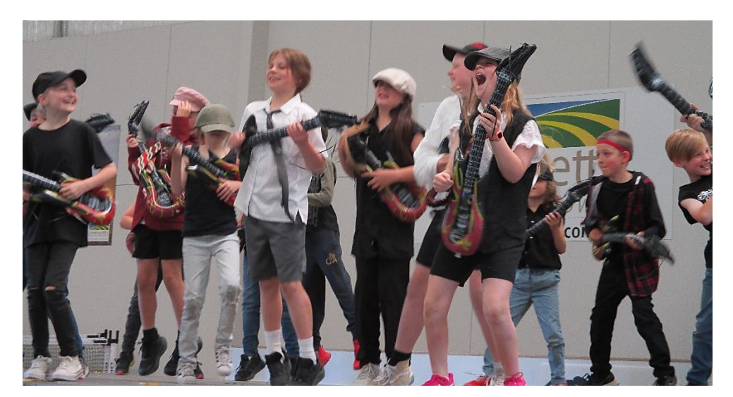
Room 3 Acca Dacca Action