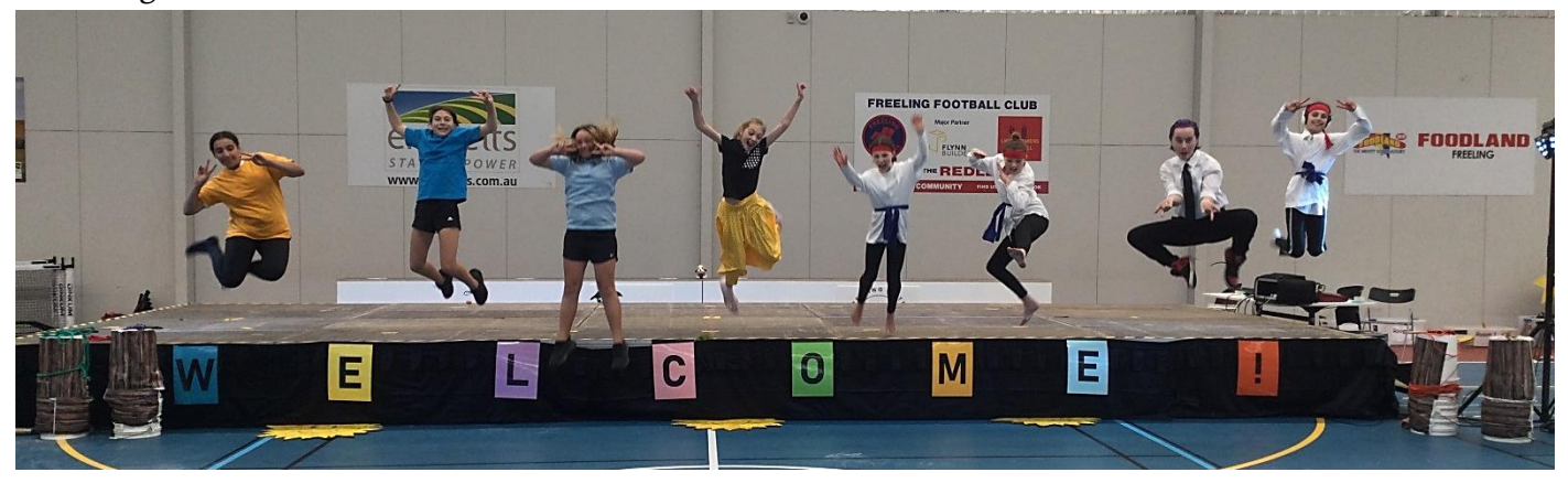
Comperes excited to welcome everyone