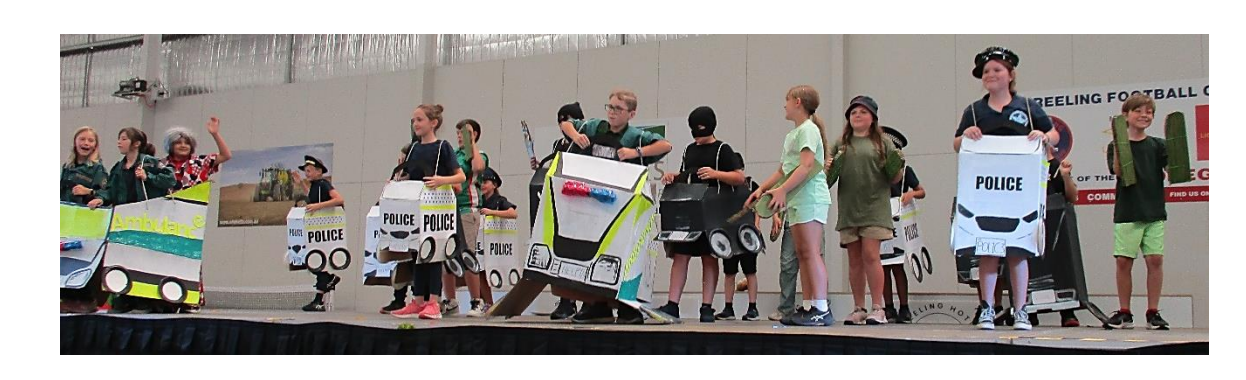
Room 10 Driving vehicles on stage